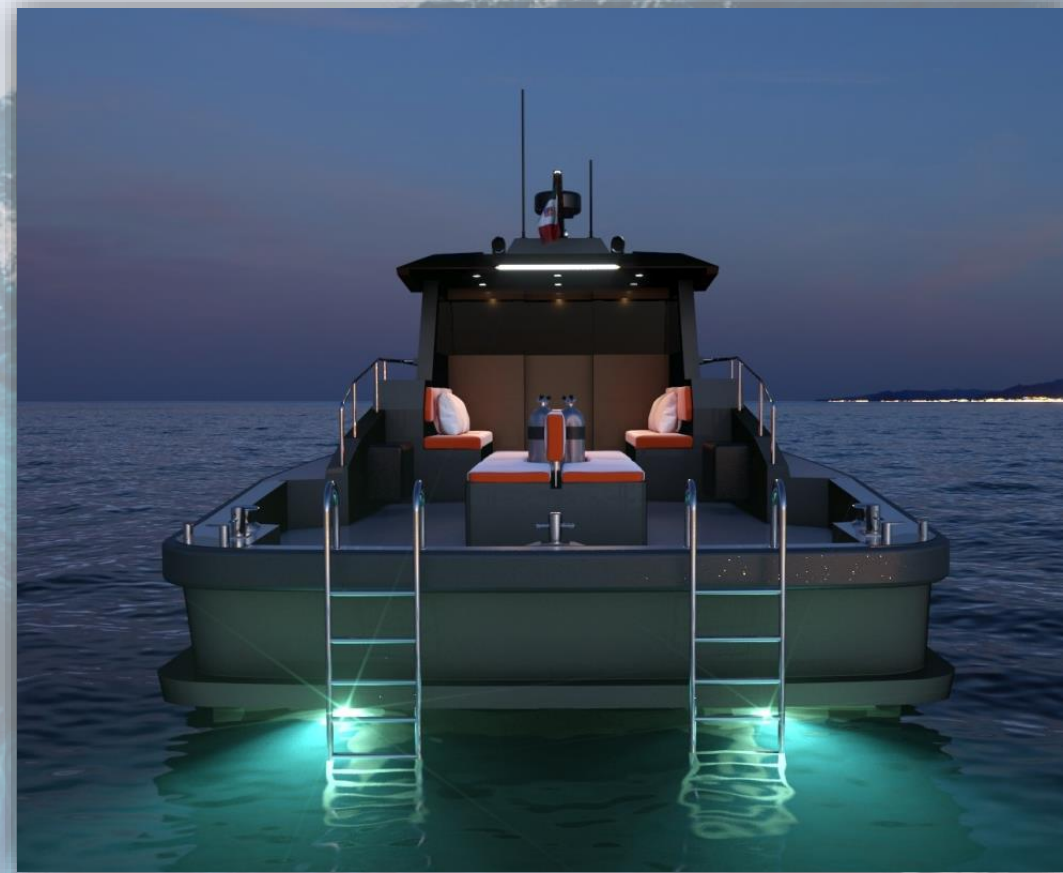
45 kW HYDROGEN FUEL CELL

The BIIM is a cutting-edge test platform for a plethora of innovative technologies. Vulkan Hybrid Architect developed the hybrid propulsion system and the overall electrical and electronical integration.